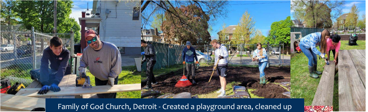
Family of God Church, Detroit - Created a playground area, cleaned up the lot, built 3 raised bed vegetable gardens and repaired picnic tables.