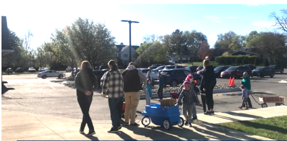
Families collected food donations from our campus neighborhood for Rochester Neighborhood House and God's Helping Hands.